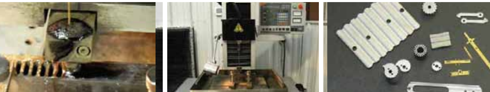
Small Hole EDM: Hole drilling from .010" Dia. to .125" Dia up to 11" deep.