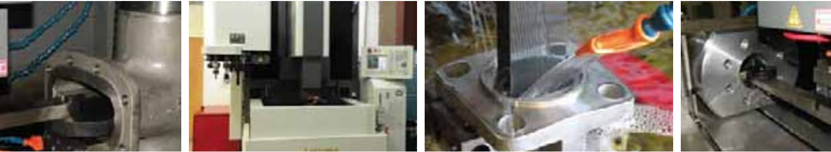
CNC Sinker EDM: Custom form machining